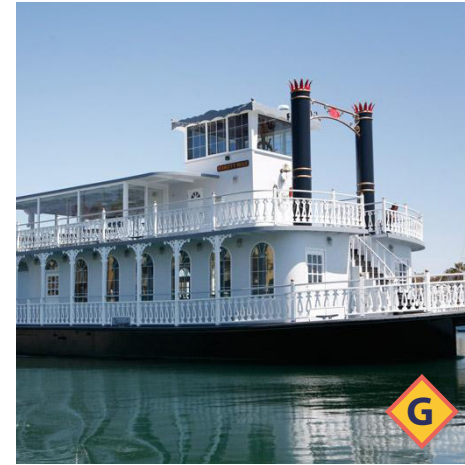
The Scarlett Belle