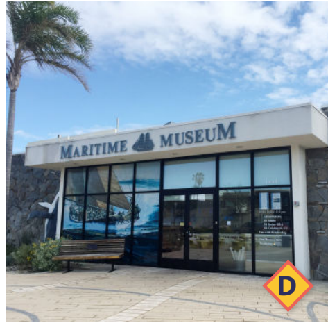
Channel Islands Maritime Museum