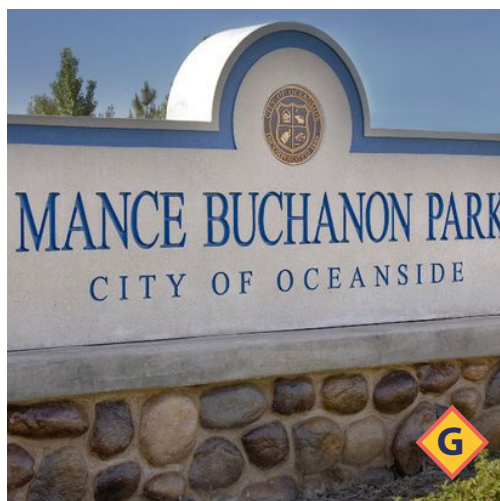
Mance Buchanan Park