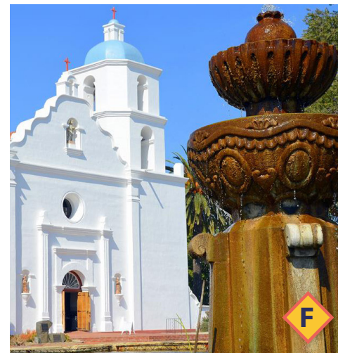
Mission San Luis Rey