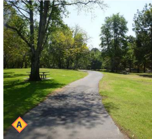
Yorba Regional Park