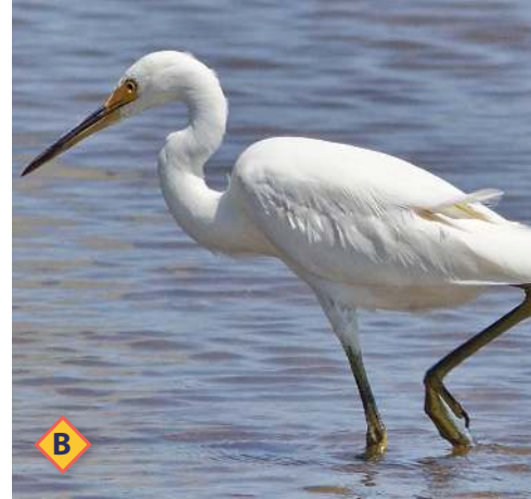
Santa Ana River