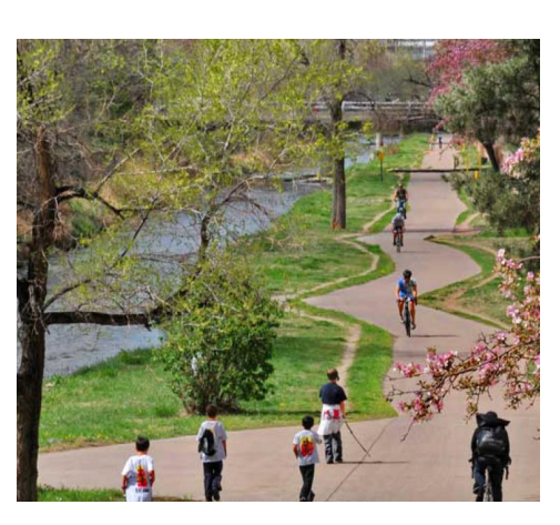
Cherry Creek Path