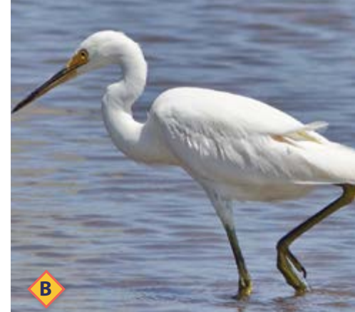
Yorba Regional Park